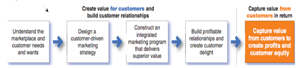
(Figure 1. Marketing Process , Principles of Marketing, Kotler and Amrstrong, 2014)

Kotler and Armstrong (2014) define marketing as a process by which companies create value for customers and build strong customer relationships in order to capture the value from customers in return. In order to survive in a competitive environment, an organization must provide its target customers more value than is provided to them by its competitors. Kotler and Armstrong (2014) presents the marketing process with five steps 1) understanding the marketplace and customer needs and wants 2) design a customer-driven marketing strategy 3) construct an integrated marketing program that delivers superior value 4) build profitable relationships and create customer delight 5) capture value from customers to create profits and customer equity. Customer value is the difference between all the benefits derived from a total product and all the costs of acquiring those benefits (Hawkins and Mothersbaugh, 2009. p. 11).