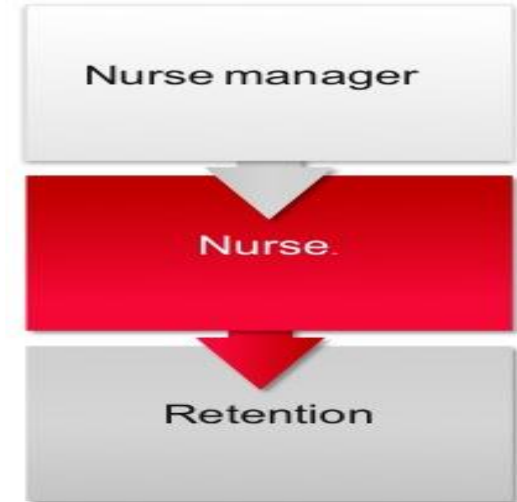
Picture 6. Nurse manager

Furthermore, as far as migration and globalization of nurses is involved, it is important that nurse's managers be able to assist foreign nurses through transition processes in order to be able to retain them.