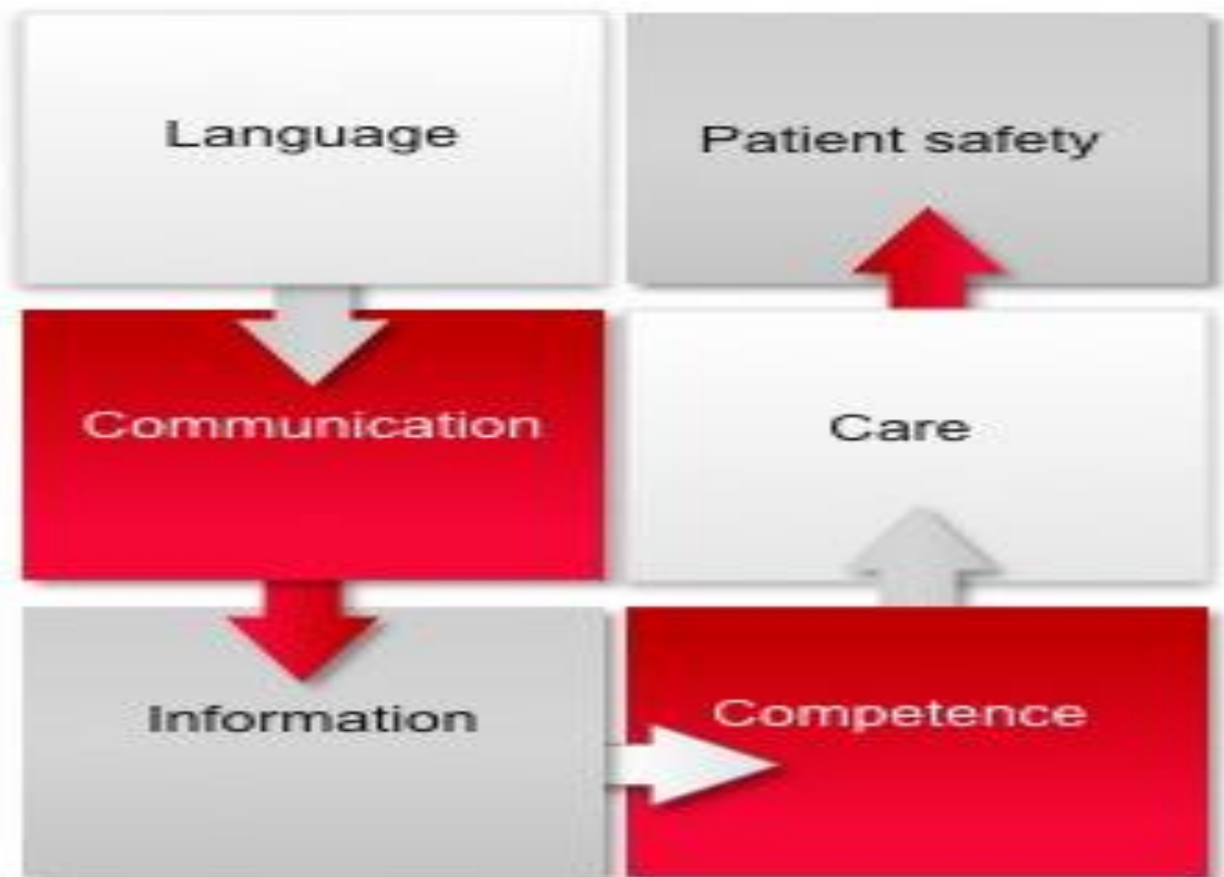
picture 2. Language as a barrier

The results indicates that almost all participants had at least one problem at the work place what was related to language barrier, communication, culture, information giving, mentoring, work load, patient client relationship, personal difference with colleagues and lack of motivation from management. The authors hopes that the result of this project will be beneficial to up coming nurses, students, nursing staffs, nurse managers, patients, clients, service users and the society as a whole. The respondents stated how language barrier affected daily activities.