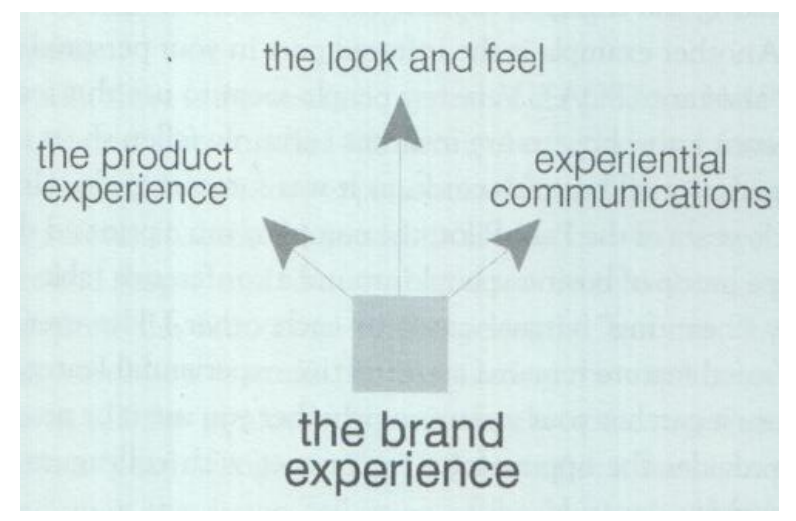
Figure 5. The Three Key Aspects of the Brand Experience

Understanding brand experience is very essential when retail brands are connecting to their target consumers. The secondary research process presented that brand experience is known as the memorable experience that is created with the use of a story that satisfies the consumer's desires. There are three aspects of brand experience; product experience, the look and feel and experiential communications (Figure 5). According to Schmitt in Customer Experience Management , the look and feel that encompasses a product includes the visual identity, packaging, store design and merchandising. Schmitt's meaning was a physical experience, when interviewee Naz Amarchi-Cuevas, from Rovio, was asked: Thinking about consumers and how they experience brand, what is your meaning of brand experience , her opinion, "brand experience is how the brand makes one feel and how one engages with a brand". Cuevas' own personal meaning stands similar to Ismail and Gabriella, that consumers love their fashion brands that are well suited to them and how it makes them feel and look good (pg.11).