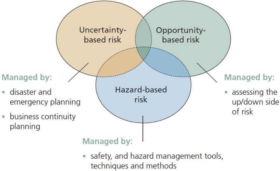
Figure 1 Three types of risk and their management. Risk Management Guide for Small Business, by Global Risk Alliance. 2005. p10.

Risks or uncertainties have their own distinct characteristics which call for particular assessment and management strategies. The Global Risk Alliance (2005) discussed that there are three types of risks as in Figure 1 below.