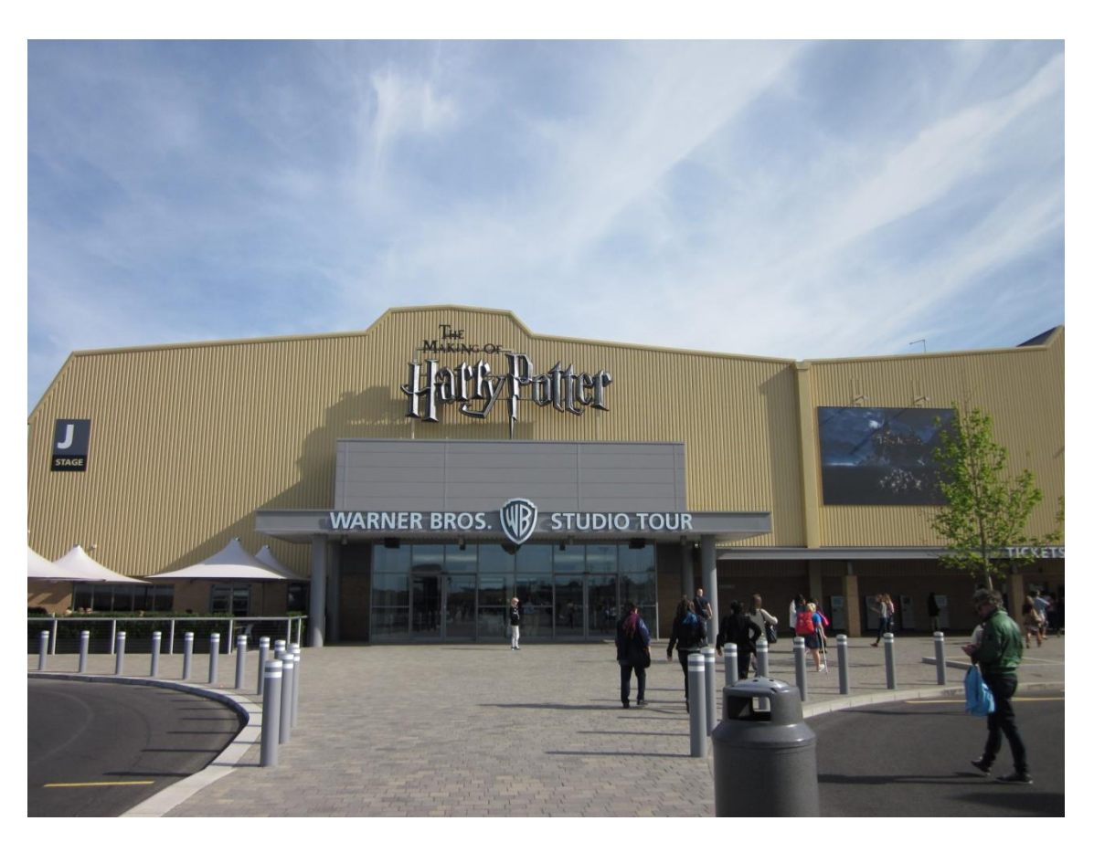
Picture 5: Leavesden Studio just outside London is the home of Harry Potter film series (Tanskanen 2012)

One of the first film related tourism products in London was the first official movie map campaign which was published in 1996 including 200 movie and TV locations in Britain (Hudson & Ritchie 2006, 391). Since the first movie map the industry has come further by developing ever more attractive film-tourism combinations. It is most appropriate to start with the film studios as they are the essence of the successful film industry in UK and in London. The British Film Commission lists ten major UK film studios, eight of which are situated in London or just outside London (British Film Commission 2012). Positioning themselves as the UK's biggest attraction the Leavesden Studios, also known as the Warner Bros Studios (Picture 5), is utilizing of being the home of Harry Potter for ten years since 2001 and is arranging tours to the original still existing set of Harry Potter (Warner Bros Studio Tour 2012). Built 70 years ago the studio originally worked as a production base for aircraft but is now attracting film fans to visit the premises where the magic has really happened and working as an excellent example of attraction built around a movie (Warner Bros Studios Leavesden 2012).