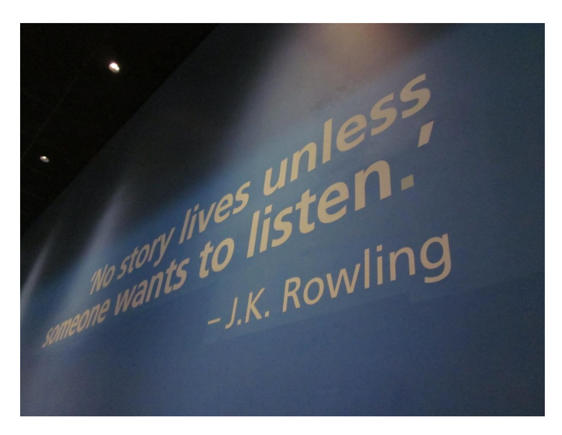
Picture 11: "No story lives unless someone wants to listen" J.K.Rowling (Tanskanen 2012)