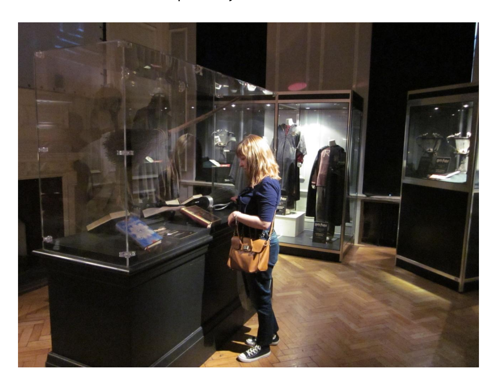
Picture 8: Room dedicated to Harry Potter at the London Film Museum (Tanskanen 2012)

The positive impact of film museums is not primarily gained through employing people, but mainly through cultural education and the reinforcement of the city's and country's image as an iconic filming location, although if an exhibition is opened around a big blockbuster movie, the museum can gain more visitors and that way utilize the marketing and the allurement power of films. Also an example of a museum that has gained new popularity as a result of a movie is the Istanbul Archaeology Museum. Even though it is not an example from London it is still worth mentioning that the museum needed to re-open the Troy exhibition because of the rise of the tourist demand after the movie Troy (2004) was released. This only shows that movies can have a great influence on people's interest towards history and culture. (Hudson & Ritchie 2006, 392.)It can be either visiting the local film museums in order to get to know the history of a certain film or it can mean visiting the exhibitions of a certain era because of the interest that has been sparked by a film.