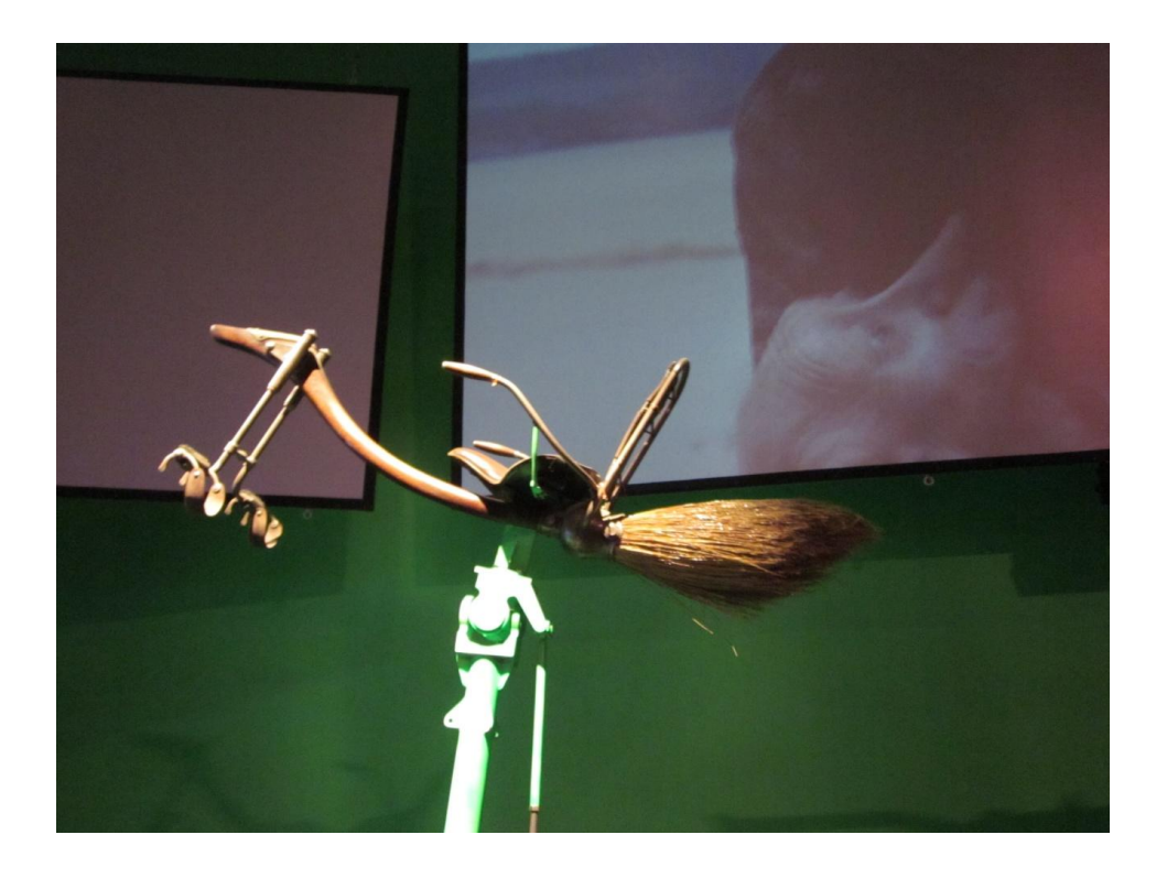
Picture 6: Visitors were allowed to experience a piece of film making with a flying broom (Tanskanen 2012)

From the beginning of the studio tour in Leavesden, the main characteristics of film tourism could be seen. As you enter the studio there is a huge souvenir shop filled with Harry Potter related items, like wands, which were also used as props later on the tour as visitors were posing with them in front of the sets. Also some prop handling was allowed at the set where visitors could push buttons and see how different technical props are actually working and also visitors were allowed to try flying on a broom (Picture 6) and see how the background is edited to the film.