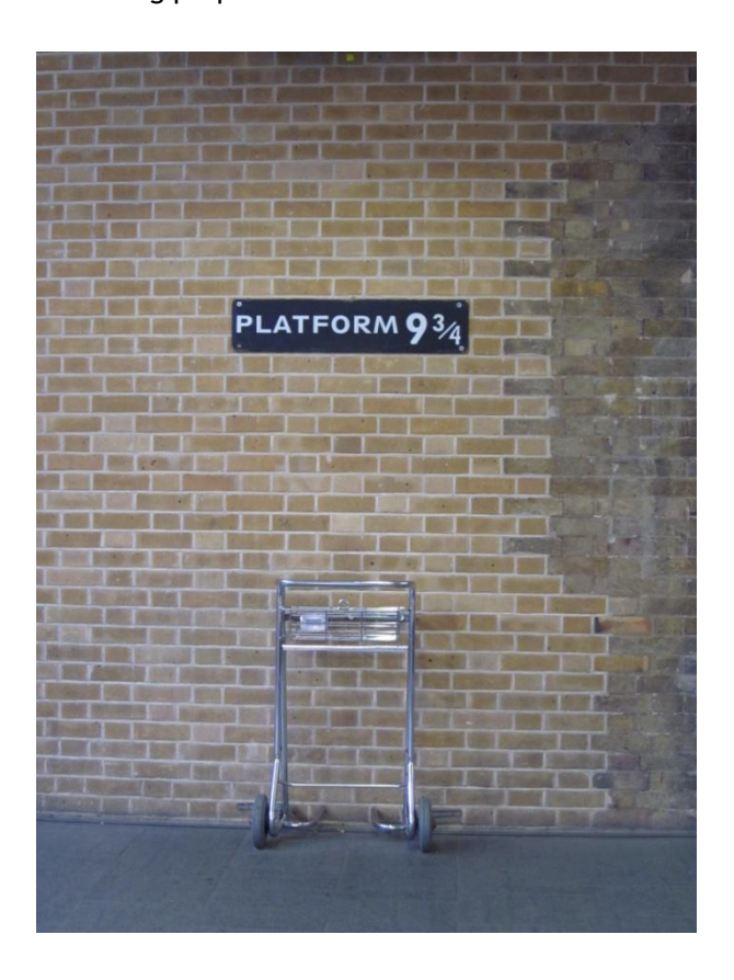
Picture 4: The Platform 9^{3/4} known from the Harry Potter movies at the London's King's Cross Station (Tanskanen 2012)

thing meaningful rather than just pass it by. The main point in harnessing a film for tourism marketing purposes is to make the film visible at the location. (Roesch 2009, 36)