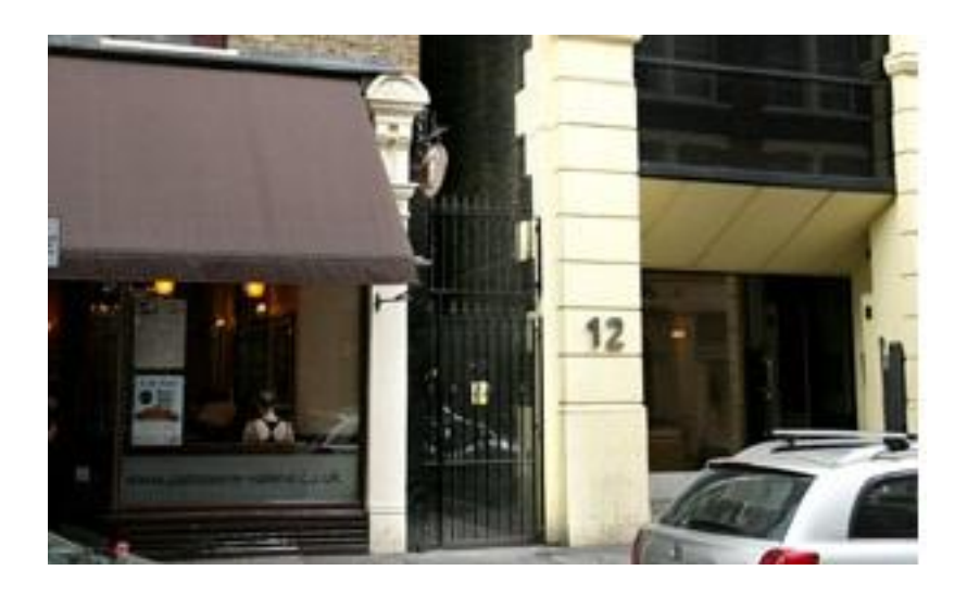
Picture 10: A gateway in London, which was used as one of the filming locations for Harry Potter, can be hard to find without a tour guide (The World Wide Guide to Movie Locations 2012)

example in the Bridget Jones movie map is included a discount voucher to the Tower Bridge exhibition and a wine discount coupon to a restaurant that was used as one of the filming locations. (Film London 2012.) So it is not always the case that the visitors need to pay a lot of money to get to marvel the filming sets and locations, but they can do the tours also independently and it is encouraged for example at the Film London web pages. However, there is benefits gained from these tourists also as they might be encouraged to use the services advertised on the side of the movie maps.