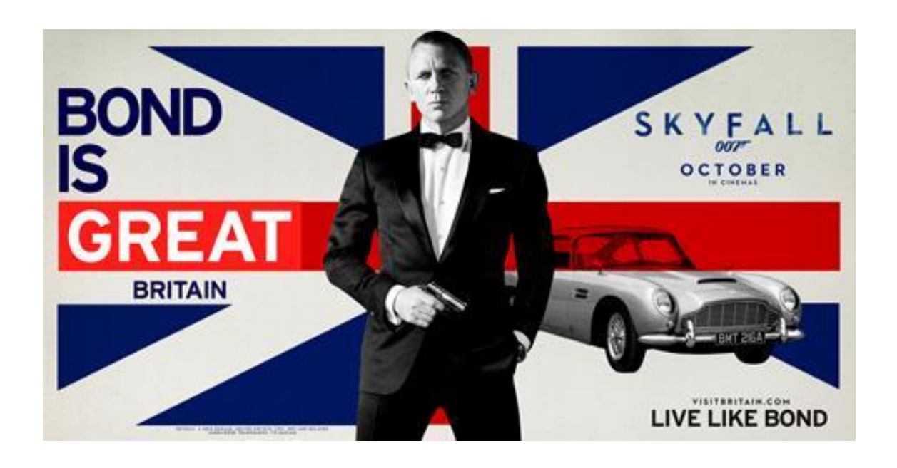
Picture 9: Bond is Great-campaign by Visit Britain (Visit Britain 2012)

The Sherlock Holmes museum is actually a great example on an especially themed attraction, which is based on a wider literary brand that has had a positive impact from becoming also a film character. It is said that many times these sites that only through theme associate to the film but are not actual filming locations can have the greatest impact on visitor numbers. The want for knowledge of a certain era or a theme arises from the films. (Olsberg SPI 2007, 4.) The strong literary brand has also made James Bond and Harry Potter strong brands on their own and after the movies were made they made those British characteristics of the stories visible for the audience and that way enhanced the appeal of UK. (Olsberg SPI 2007, 20.)