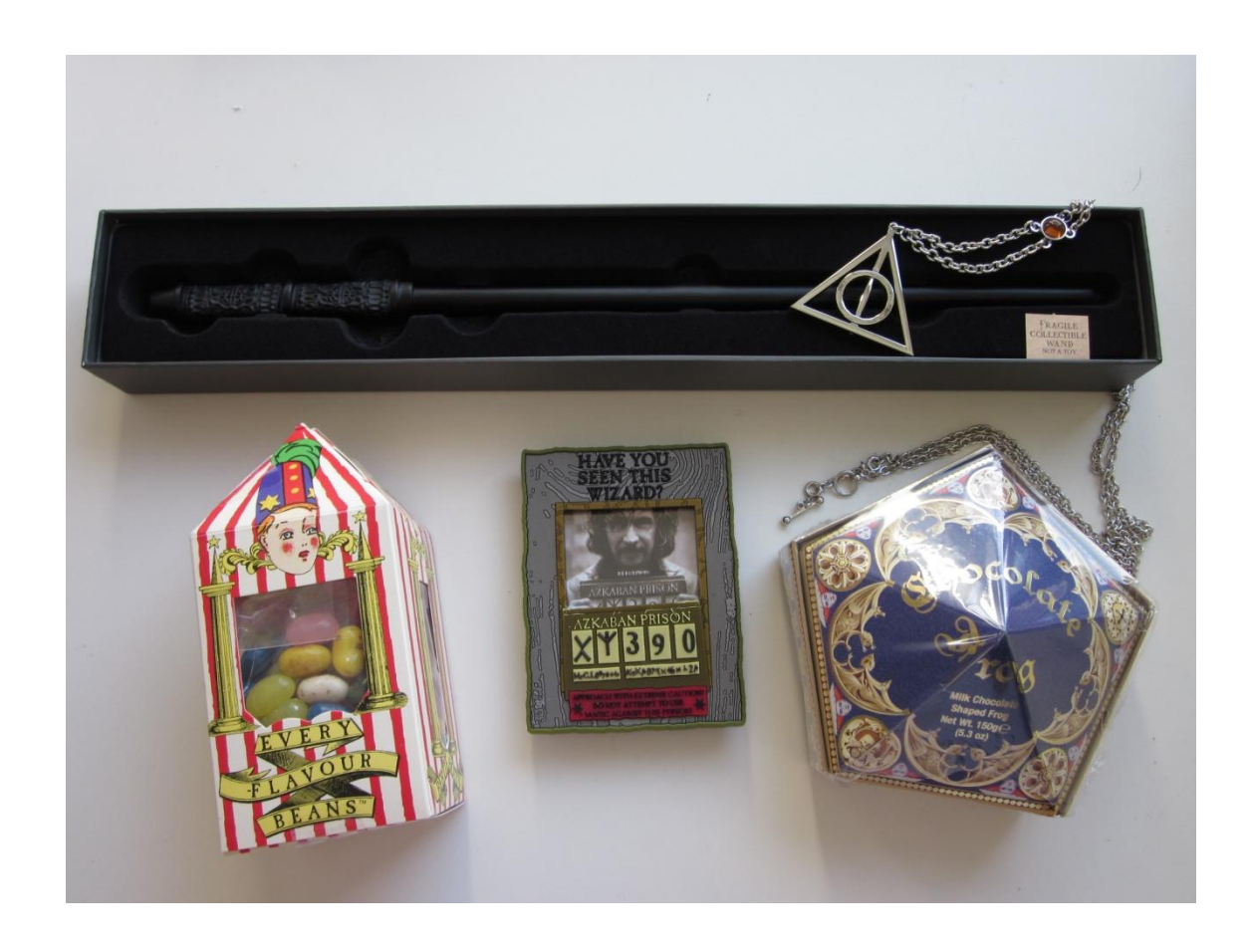
Picture 1: Harry Potter related souvenirs bought from the Warner Brothers Studio Tour London (Tanskanen 2012)

5 Results: Films as tourism promoting business