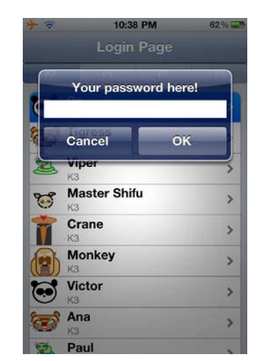
Figure 2. The User Interface of Our e-Learning System for the login page on an iPad

The MS Paint program is used to build the templates of Chinese characters for our extendible e-learning system. Figure 2 shows the graphical user interface of our e-learning system with a login page prompting for the user's password on an iPad. Figure 3 gives the user interface of our e-learning system run on an iPad when invalid inputs to display all the relevant functions such as the "history", "practice", "similar characters" and "practice" to learn about more detail of a Chinese character. All these relevant functions will provide a comprehensive view for foreigners or even native Chinese students to learn about the character at hand.