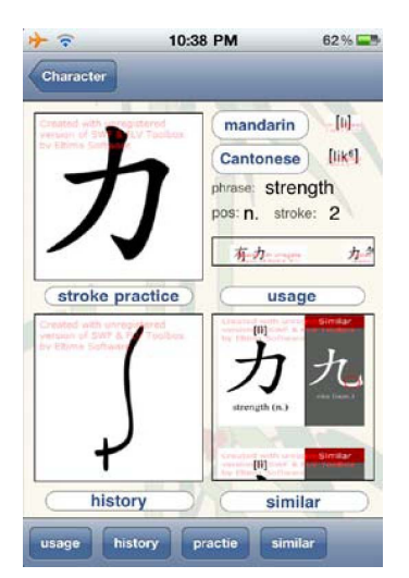
Figure 3. The User Interface of Our e-Learning System for the detail of a Chinese character displayed on an iPad