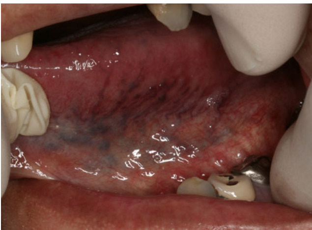
Fig. 2 Oral mucosal telangiectasia on lateral border of tongue

Inter-examiner agreement on caries and periodontal assessment were computed using Cohen's Kappa statistics. The data were analyzed using SPSS 17.0 (SPSS Inc., Chicago, USA). Chi-square test and Fisher exact test were used to study the oral hygiene habits (tooth-brushing and use of other oral hygiene aids), periodontal status, dental visit