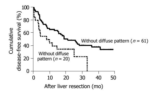
Figure 3 Disease-free survival analysis shows the differences in disease-free survival in patients with or without diffuse pattern of CD105 staining in non-tumorous livers. Five patients were excluded from the analysis because of hospital mortality or palliative resection with positive resection margins.

Disease-free survival analysis was performed in 81 patients after 5 patients with hospital mortality or palliative resection (i.e. positive resection margin) were excluded. No prognostic significance was observed when median values were used as cut-off points using either IMVD-CD105 or IMVD-CD34. However, as shown in Figure 3, when the patients were segregated by the presence and absence of diffuse CD105 staining patterns in the adjacent non-tumorous liver tissues, the patients with diffuse CD105 staining in the adjacent non-tumorous livers had a much poorer prognosis than those patients without such a pattern of CD105 staining (median disease-free survival 8.6 vs 21.5 mo, P = 0.026).