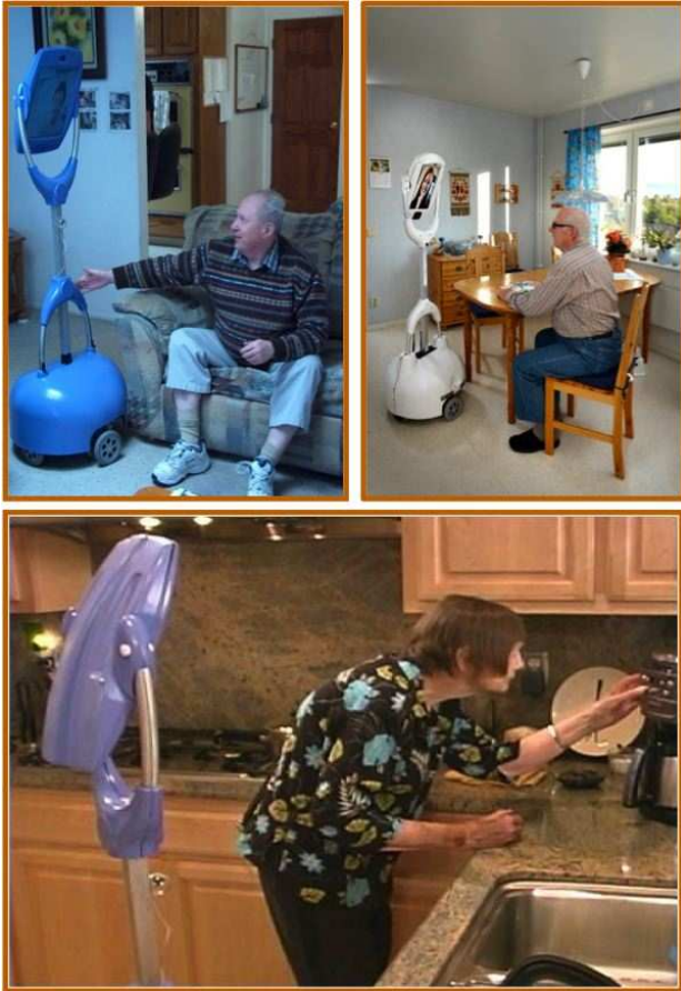
Fig. 2. Examples of Giraff prototypes

by driving it onto docking station. The docking station charges the batteries in under two hours. A full charge is sufficient to allow the Giraff to wander untethered for over two hours. Extended use batteries with a four hour life are also available. The Giraff can also be used while being charged, although naturally it must stay on the docking station.