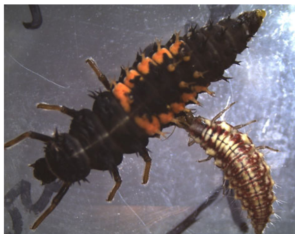
Figure 1. Third instar C. carnea larva biting into soft abdominal segments of its intraguild prey, fourth instar H. axyridis larva.

The native lacewing C. carnea was the superior intraguild predator in trials against the invasive ladybird H. axyridis ; two hoverfly species, E. balteatus and E. eligans defended themselves against IGP. Until now, there was only one member of the aphidophagous guild known to effectively kill H. axyridis , the eyed ladybird A. ocellata , which is larger than H. axyridis . C. carnea is the first aphidophagous insect that appeared superior to H. axyridis in IGP encounters despite its smaller size.