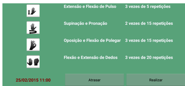
Figure 2: An example of a session with four exercises in the Interactive Occupational Therapy system. Left column: icon for each exercise. Middle column: exercise name. Right: instructions on the number of repetitions for each exercise.

therapists to send and receive private messages inside the application.