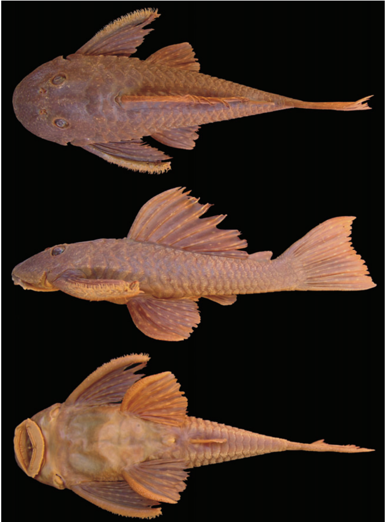
Fig. 6. Hypostomus myersi , NUP 680, 146.2 mm SL, Salto Caxias reservoir, rio Iguaçu, Municipality of Capitão Leônidas Marques/Nova Prata do Iguaçu, Paraná, Brazil.