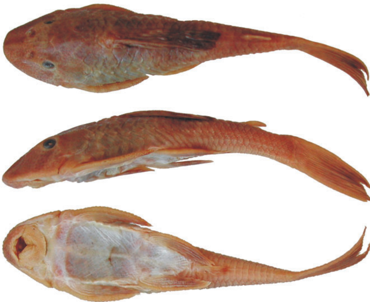
Fig. 3. Holotype of Hypostomus derbyi , FMNH 54246, 90.5 mm SL, Porto União da Victoria, currently Municipality of União da Vitória, rio Iguaçú, Paraná, Brazil.

1944, G. S. Myers & A. L. Carvalho. NUP 151, 2, 186.9-207.4 mm SL, mouth of rio Chopim, Municipality of Cruzeiro do Iguaçú/São Jorge do Oeste, 25°34'28"S 43°04'24"W, 5 Aug 1999, Copel. NUP 555, 1, 130.4 mm SL, Cavernoso reservoir, rio Cavernoso, Municipality of Virmond/Laranjeiras do Sul, 23-24 Aug 1999, Copel. NUP 585, 5, 184.6-268.0 mm SL, Jordão reservoir, rio Jordão, Municipality of Foz do Jordão/Reserva do Iguaçú, 25°45'13"S 52°05'09"W, 14 Oct 1995, Copel. NUP 586, 2, 234.0-240.0 mm SL, Jordão reservoir, rio Jordão, Municipality of Foz do Jordão/Reserva do Iguaçú, 25°45'13"S 52°05'09"W, 14 Oct 1995, Copel. NUP 587, 8, 149.0-207.3 mm SL, Jordão reservoir, rio Jordão, Municipality of Foz do Jordão/Reserva do Iguaçú, 25°45'13"S 52°05'09"W, 14 Oct 1995, Copel. NUP 677, 2, 228.3-230.6 mm SL, Salto Caxias reservoir, rio Iguaçú, Municipality of Capitão de Leônidas Marques/Nova Prata do Iguaçú, 25°32'12"S 53°29'11"W, 13 Aug 1997, Nupélia. NUP 679, 5, 274.0-339.0 mm SL, Salto Caxias reservoir, rio Iguaçú, Municipality of Capitão de Leônidas Marques/Nova Prata do Iguaçú, 25°32'12"S 53°29'11"W, 13 Aug 1997, Nupélia. NUP 715, 5, 47.9-58.0 mm SL, Salto Caxias reservoir, rio Iguaçú, Municipality of Capitão