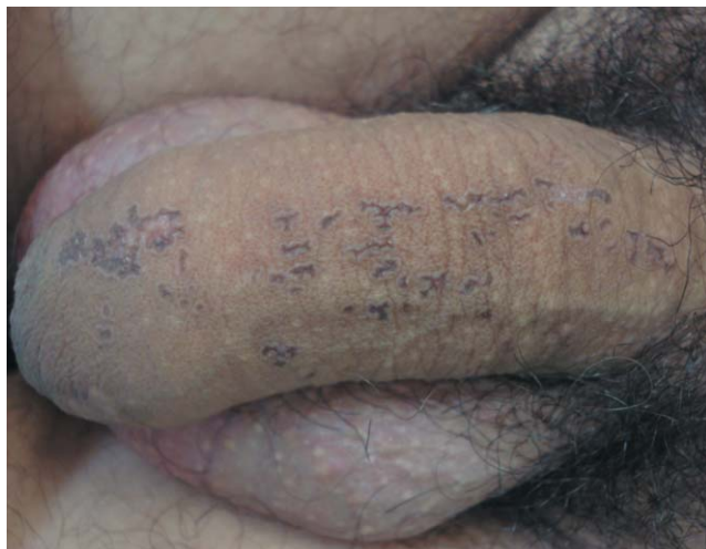
FIGURE 1: Linear lesions with fine keratotic walls and atrophic, violaceous center on the dorsal shaft of the penis

sis: hyperkeratotic and parakeratotic stratum corneum (cornoid lamella) and underlying diskeratosis (Figure 2). The patient was treated with topical liquid-nitrogen cryotherapy for five sessions over a 6-month period. Over the 2-year follow-up period, the lesion improved and there is no evidence of recurrence or malignant transformation. The patient's informed consent was obtained for this report.