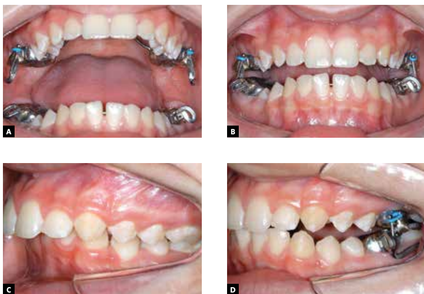
Figure 1 - A) MARA appliance in place with its components. B) The loops on the crowns create occlusal interference and hinder Class II occlusion. C, D) Photos taken before and after placement of the appliance.

Some studies describe the skeletal and dental effects produced by the MARA. 10,11,13,26,28 However, only two systematic studies have been published on the dental and skeletal changes observed in the correction of Class II, division 1. In 2003, Pangrazio-Kulbersh et al 26 evaluated the cephalometric effects produced by the MARA in 30 patients (12 male and 18 female)