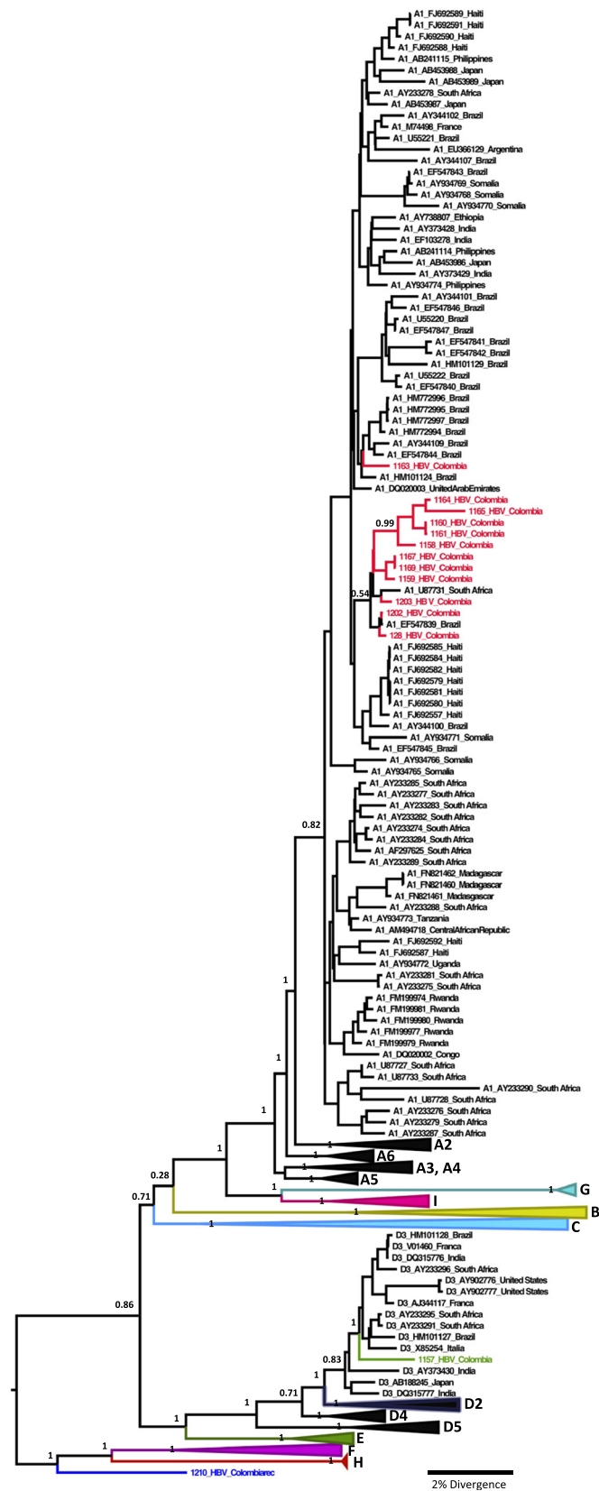
Figure 1 (See legend on next page.)