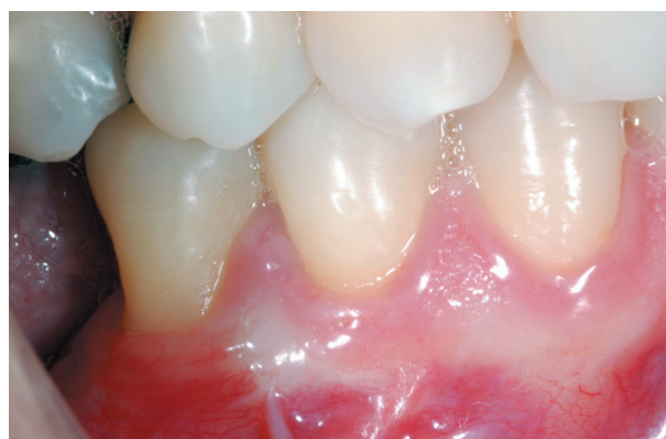
Figure 3- Buccal view of the area 9 months after treatment, suggesting gingival health and reduction of recession

Table 1 describes RD, PD, CAL, BOP, PI, KGW and the percentage of root coverage observed at buccal sites at baseline and at the postoperative examinations for all cases described. A reduction in RD was observed for all cases after 9 months, although Cases 2 and 3 showed a slight relapse from 3-month to 6- and 9-month examinations. All cases resulted in CAL gain and reduction or stability of PD measures, as well as absence of plaque accumulation and BOP. Cases 2, 3 and 4 showed a slight increase in KGW, while no change was observed in Case 1. Figure 3 shows the results obtained in Case 1, in which CAL gain was observed at interproximal and buccal sites, along