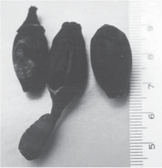
Fig. 3. Larva of Thepytus echelta (Lycaenidae) on the peduncle of Psittacanthus acinarius (Loranthaceae) fruit.

only species that expressed some potential for use as a biological control agent against this mistletoe. This is because the caterpillars produced a hole in the pericarp of the fruit to reach the seeds that indeed they did eat, thus eliminating the cotyledons and the viscin. Because of this behavior T. echelta may completely impede seed germination. However, their population during the period of the survey was very low (Table 2).