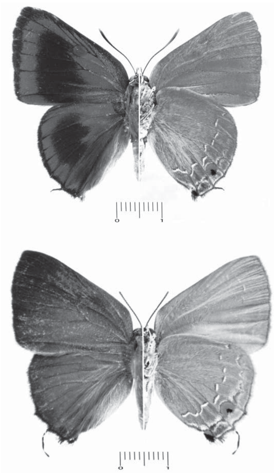
Fig. 2. Male (above) and female (below) of Thepytus echelta (dorsal [right] and ventral [left] views, respectively) (Photos by Marcelo Duarte-USP, SP).