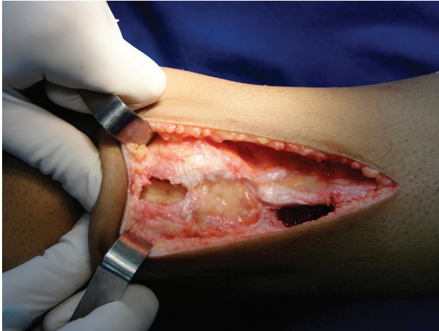
Figure 2. Patellar tendon harvest site prepared to receive (or not) platelet-rich plasma.

plasma was separated from platelet-poor plasma (PPP) and red blood cells in different sterile collection bags. The red blood cells and PPP (up to 400 mL) were returned to the patient from their collection bags through the peripheral venous access. With this system, we could obtain 30 to 50 mL of PRP. So, in fact, the total amount of blood collected from the patient is up to 50 mL.