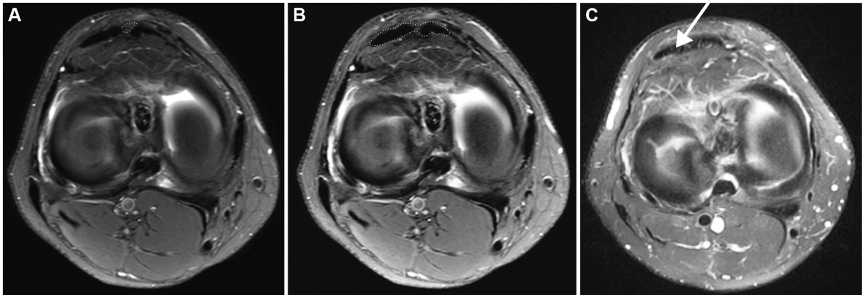
Figure 4. Using magnetic resonance imaging (MRI), (A) the gap area of the patellar tendon harvest site and the cross-sectional area of the patellar tendon (B) were calculated through the midpoint along the length of the tendon from the apex of the patella to the insertion at the tibial tubercle, as shown in this control group patient. (C) An MRI scan of a platelet-rich plasma group patient, showing a smaller gap (arrow).

were considered based on previously published data (Figure 4). 7,21-23,29