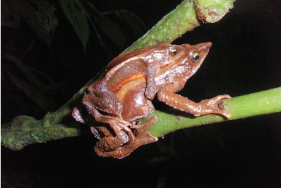
Fig. 2: A pair of Atelopus nahumae RUIZ-CARRANZA, ARDILA-ROBAYO & HERNÁNDEZ-CAMACHO, 1994, in amplexus.