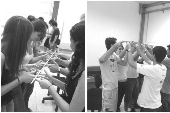
Fig. 1. Students in a dynamic activity.

activity. In this activity students should elect a leader and follow the leader's instructions to perform a simple activity. Under this scenario several characteristics of team working conditions, such as natural versus delegated leadership or as the confidence level in the leader by team members, were brought up and analyzed by the students after the exercise is finished.