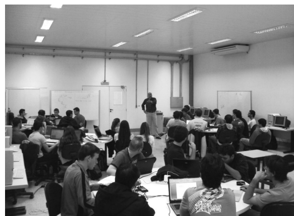
Fig. 2. Students at the 'aircraft design atelier'.

The students' groups work then through a process of conceptual design, using most of the acquired knowledge during the past 4 years of the engineering course they attended to. Although, at