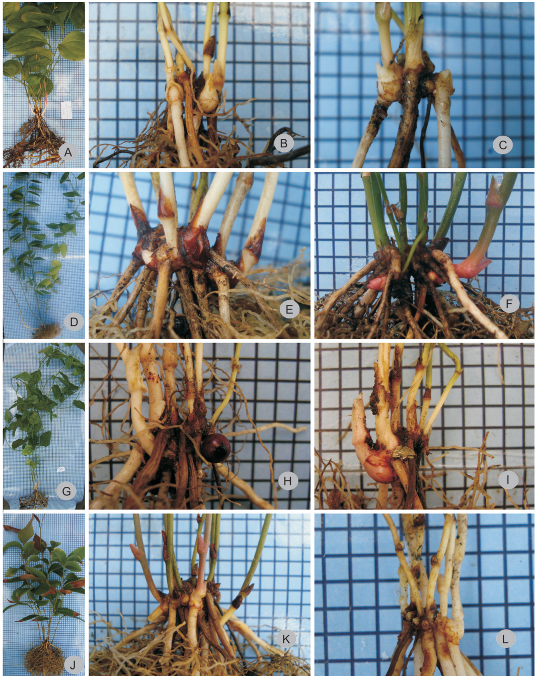
Fig. 3. A.-C. Smilax brasiliensis . D.-F. Smilax campestris . G.-I. Smilax cissooides . J.-L. Smilax polyantha . A., D., G., J. One-year old plant. B.-C., E.-F., H.-I., K.-L. Detail of the new stems development from underground axillary buds. Scale: side of the square is 0.5cm.