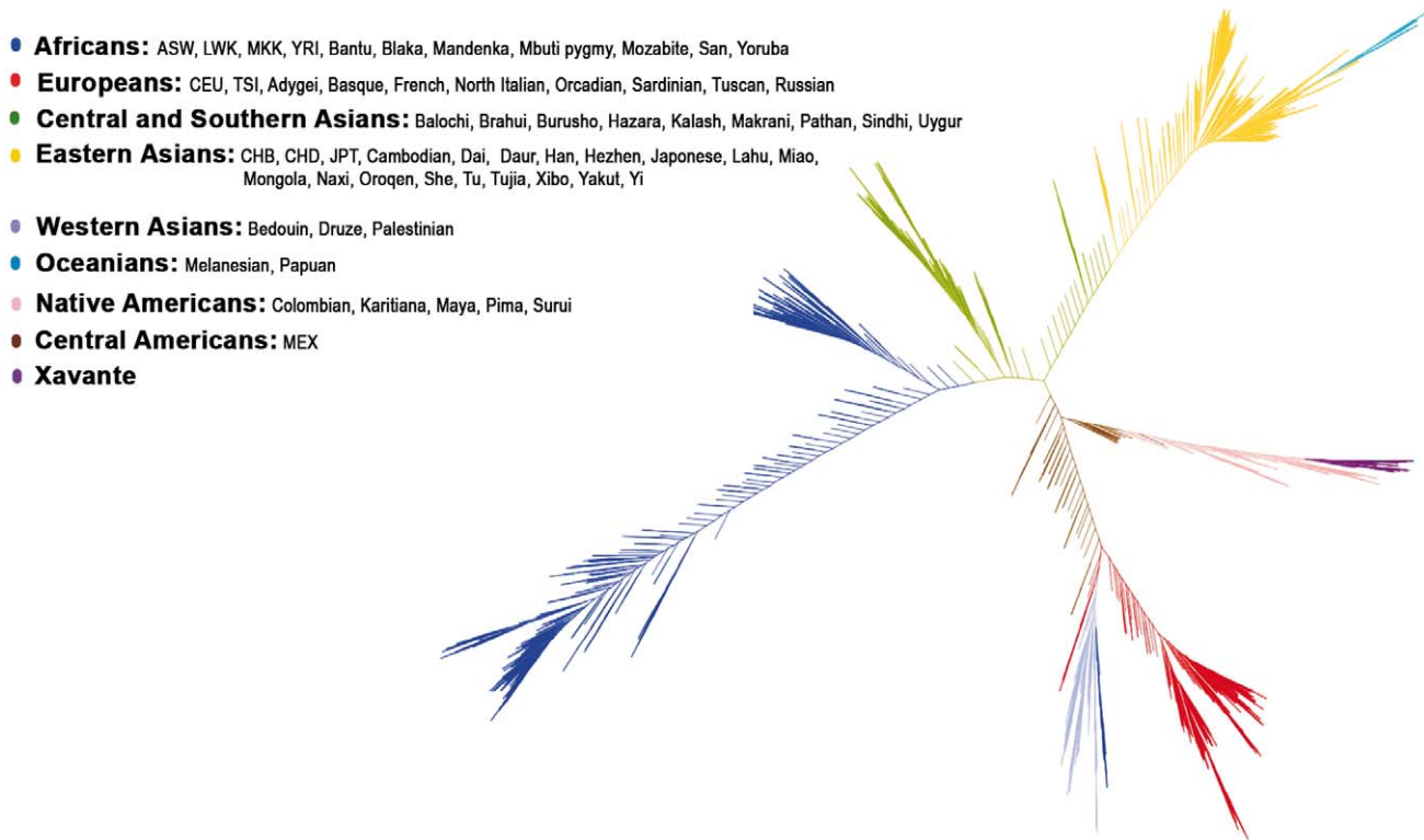
Figure 3. Neighbour-joining tree for the final dataset. The individuals were color labeled according to geographical distribution of their populations. ASW: African ancestry in Southwest USA; CEU: Utah residents with Northern and Western European ancestry from the CEPH collection; CHB: Han Chinese in Beijing, China; CHD: Chinese in Metropolitan Denver, Colorado; JPT: Japanese in Tokyo, Japan; LWK: Luhya in Webuye, Kenya; MEX: Mexican ancestry in Los Angeles, California; MKK: Maasai in Kinyawa, Kenya; TSI: Toscani in Italy; YRI: Yoruba in Ibadan, Nigeria. doi:10.1371/journal.pone.0042702.g003

early results [8], and it corroborates the long history of intermarriage between Europeans and Africans descent in the Brazilian population.