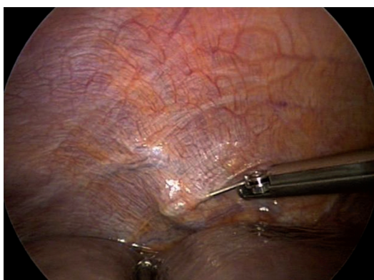
Figure 2 - Electrode being implanted into the right hemidiaphragm.

The laparoscopic ports were withdrawn under direct visualization, fascia and skin incisions were closed, and the wounds were dressed. Gold pin connectors were attached to the ends of the electrodes, which were subsequently inserted into the connector block. The connector block was