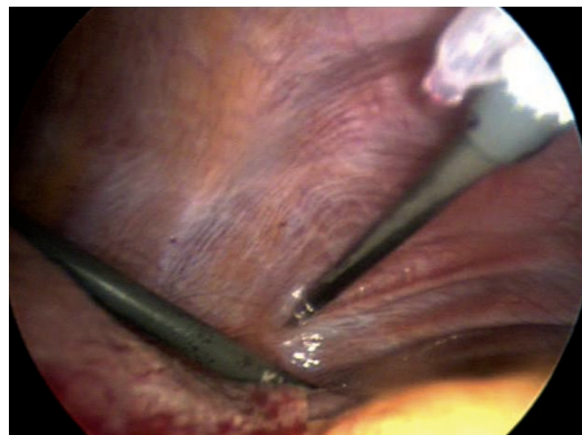
Figure 1 - Dissector being used in order to map the diaphragm. Note diaphragmatic contraction.

After the electrodes had been implanted, Maryland dissectors were used in order to hold the wires in the abdomen as the implantation device was backed out through the midline port. Those pacing wires were passed out percutaneously