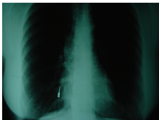
Figure 2 – Chest X-ray showing a foreign body (tiny screwdriver), which was removed with flexible bronchoscopy under fluoroscopic guidance.