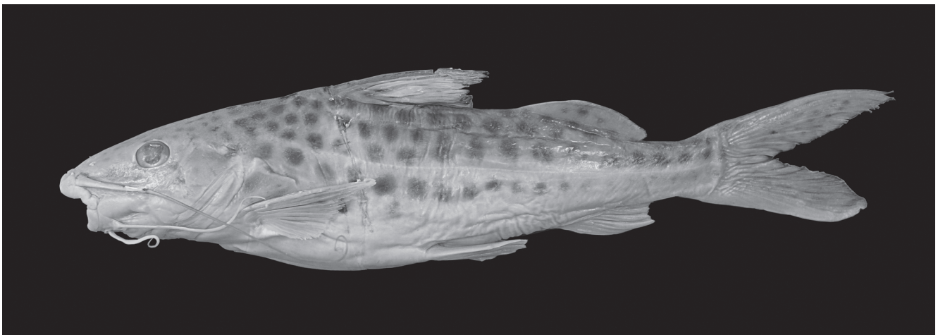
Fig. 2. Pimelodus multicrotifer , paratype, MZUSP 45465, 118.6 mm SL, rio Pilões, rio Ribeira de Iguape basin, lateral view.

Etymology. From the Latin multi-, meaning many, numerous; cratis, from the Latin noun cratis, meaning rake, in reference to gill rakers; and fer from the Latin verb fero, meaning "to bear, carry, support, lift, hold, take up".