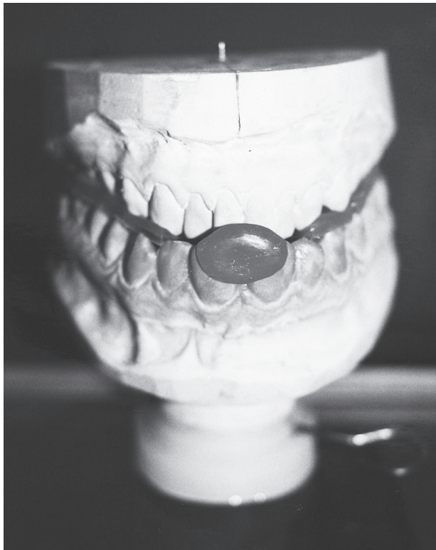
Figure 1. The mandibular cast articulated with maxillary cast by means of jig and wax record.

Technique C was the bimanual manipulation