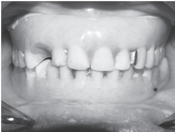
Figure 1. Intraoral anterior frontal view of a complete denture wearer with TMD.

The bite force data were subjected to statistical