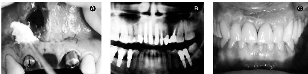
Figure 2. Panel of clinical and radiographic images of the case. A= Fulfilling of the surgical chamber with xenogenous bone graft after implant placement; B= Radiographic aspect at the 3-year follow-up visit after the definitive denture placement; C= Clinical aspect at the 3-year follow-up visit after the definitive denture placement.