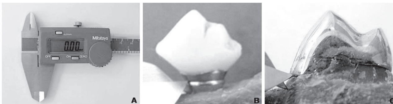
Figure 2. In situ measurements of the alveolar bone crest heights 16 weeks after crown placement (38 weeks after the beginning of the study). A: Digital caliper used in the study. B: In Group I (implant-supported crowns), the measurement corresponded to the distance between the implant platform and the top of the alveolar bone crest; C: In Group II (tooth-supported crowns) the measurement corresponded to the distance between a reference point at the cervical margin of the crown and the top of the alveolar bone crest.