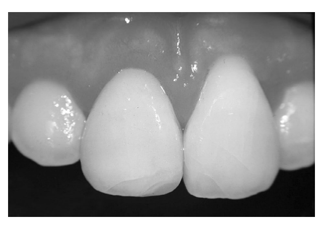
Figure 5. Clinical view 2 years after the injury. The right central incisor was restored with composite resin. The appearance, gingival contour, and function were normal.