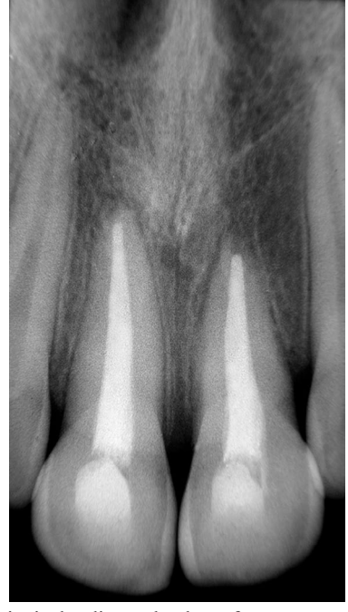
Figure 4. Periapical radiograph taken after root canal treatment.

apices (10). Studies have shown that if loss of vitality or root resorption is present, the pulp must be removed and a dressing of non-setting calcium hydroxide must be placed in the canal, to prevent toxins of the necrotic pulp from triggering an inflammatory resorption (11,12). In the present report, an endodontic treatment including dressing of the root canal with a calcium hydroxide-based paste was performed, which is usually necessary in the case of teeth with mature apices undergoing large