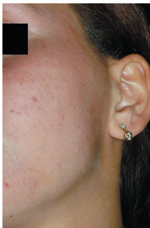
Figure 5- Complete recovery of the skin and remission of the swelling after 30 days