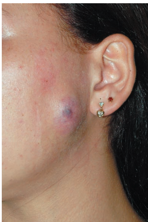
Figure 4- Erythema on the overlying skin after the percutaneous needle aspiration