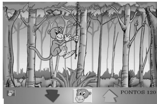
Figure 2. Screen design (A and B). A represents the stimulus discrimination phase, and B represents the ordering phase. On both screens, there is a setting (forest) and a main character (monkey) that shows a goal (to get the bananas using a bush rope). Players are instructed to listen to two or three nonverbal stimuli and to associate them with the sign displayed on the screen (Figure 2A = or ≠ for discrimination; Figure 2B \uparrow or \downarrow for ordering, where \uparrow represents the rising stimulus and \downarrow represents the falling stimulus).