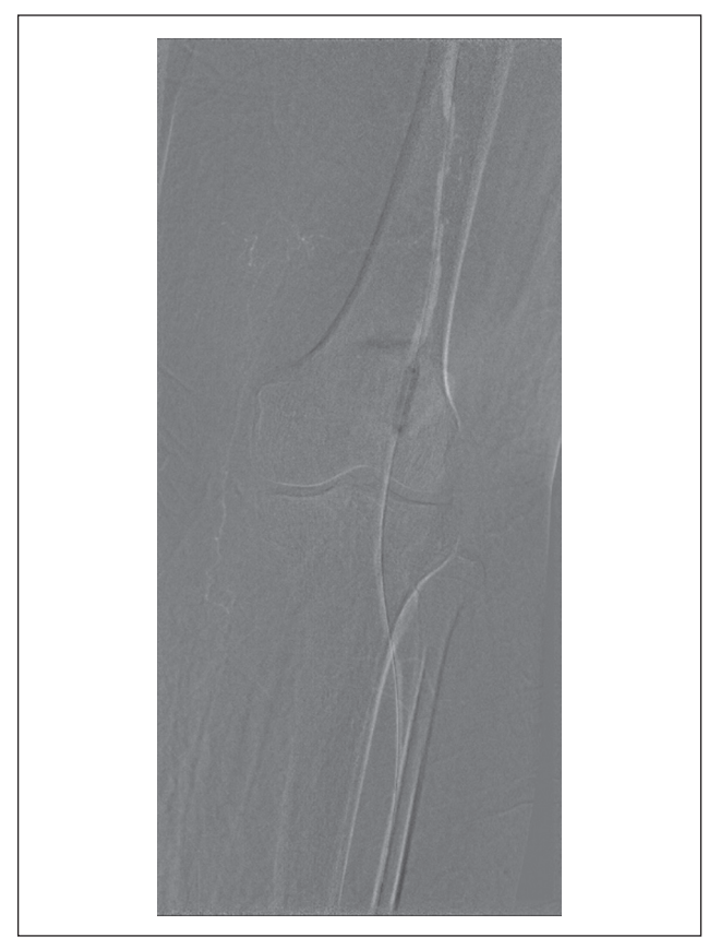
Figure 6 - Angioplasty of sciatic artery using 5\,\mathrm{x} 20 mm balloon.