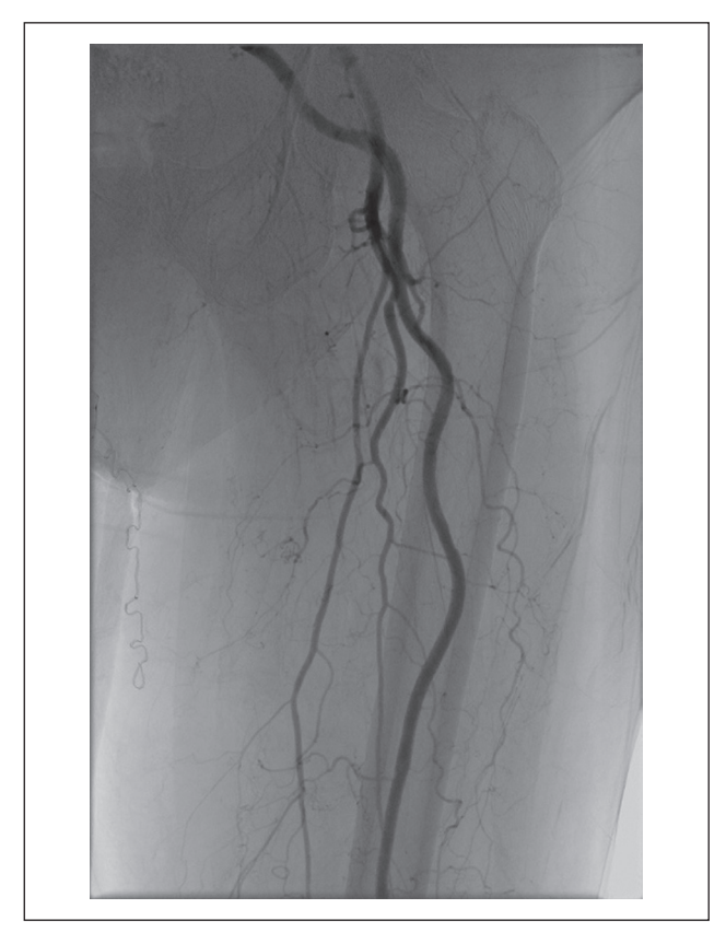
Figure 3 - Arteriogram shows hypoplastic superficial femoral artery.