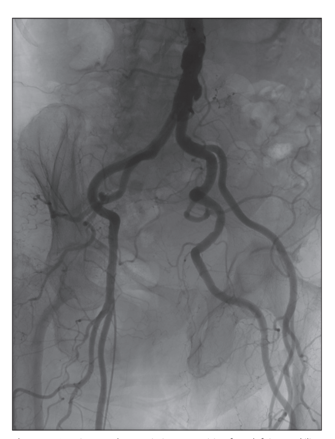
Figure 2 - Arteriogram shows sciatic artery arising from left internal iliac

PSA is a vascular anomaly whose origin is well known. Embryos reach 9 mm at about the 6th week. In this phase, the sciatic artery, or axial artery, arises from the dorsal root of the umbilical artery and becomes the major source of blood to the primitive foot. When the embryo is 10 mm long, the femoral system starts to develop as a continuation of the external iliac artery, which expands and branches out to irrigate the thigh. When the embryo reaches 14 mm, at about 8 weeks, the lower limb has a dual blood supply system, the sciatic and the femoral ones. At about 12 weeks, the sciatic artery involutes, and the superficial femoral artery develops. In adults, remnants of the sciatic artery participate in the formation of gluteal arteries, popliteal artery, and the origin of anterior tibial and fibular arteries, and contribute to the terminal anastomosis of the foot<sup>1,2,7</sup>.