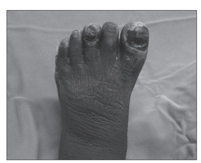
Figure 1 - Image shows trophic ulcers in foot.

Dual antiplatelet therapy was initiated with 100 mg/day of acetyl salicylic acid and clopidogrel at 300 mg loading dose and 75 mg/day thereafter. Immediately after surgery,