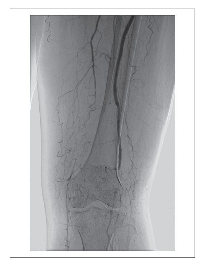
Figure 4 - Arteriogram shows site of arterial occlusion.