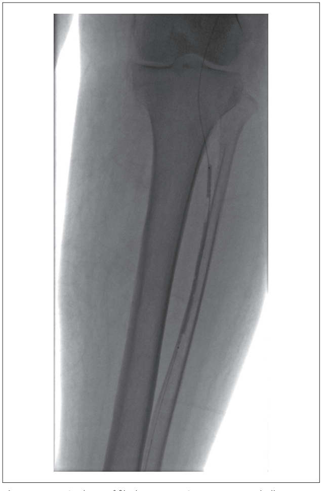
Figure 7 - Angioplasty of fibular artery using 3 x 120 mm balloon.