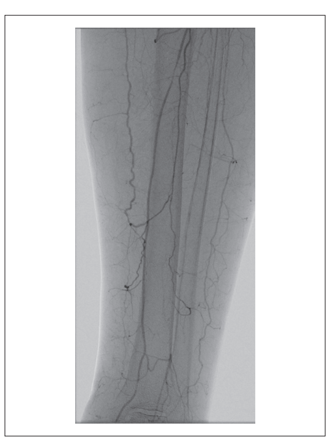
Figure 5 - Arteriogram confirms atherosclerotic occlusion of leg arteries.