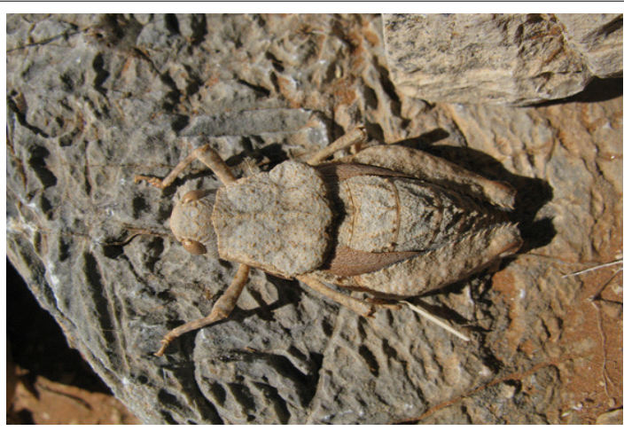
Stone-mimicking grasshopper on desert pavement in Namibia.

As per its mandate, the book covers an impressively wide array of topics, spanning desert history and formation, abiotic factors, details of organismal adaptations to desert life, the array of biotic interactions in deserts, desert food webs, desert diversity and biogeography, and finally human impacts and management of desert systems. As a result it is relevant to students of ecology, evolution, physiology, behaviour and many other disciplines as well as to desert users and managers. The book does a great job of balancing examples from plants and animals. The topics are presented logically, and each section is supported by numerous examples and figures from the primary literature. In a few instances the link