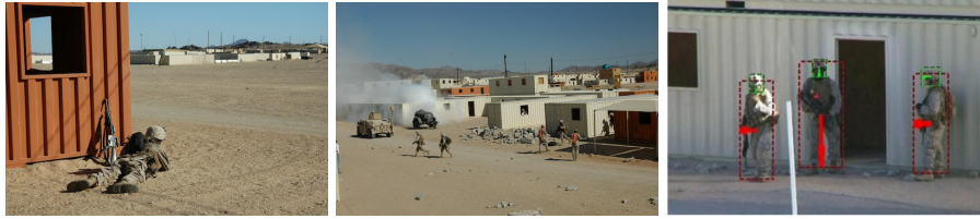
Figure 1: Observing in a “prone” posture, crossing a danger area, and results from our posture recognition method.