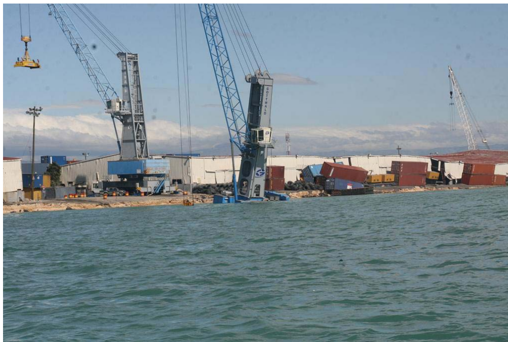
Figure 1. Images of the Destruction of the Port at Port-au-Prince, Haiti, Captured by the U.S. Coast Guard Cutter Forward in the Aftermath of the January 12, 2010, Earthquake (Simmins, 2010)

(USCG) cutter Forward was diverted from its patrolling duties in the Caribbean to Port-au-Prince, and USCG helicopters were also deployed. The Forward arrived within 17 hours of the disaster and provided some of the first images and reports of the devastation in Haiti (Figure 1). Ships, cutters, and aircraft assisted in evacuating thousands of injured Haitians and Americans, delivering medical and emergency supplies, and beginning the process of restoring the port's infrastructure. These efforts demonstrate how an organization's assets, competencies, capabilities, authorities, and partnerships bring forth a unique ability in humanitarian operations.