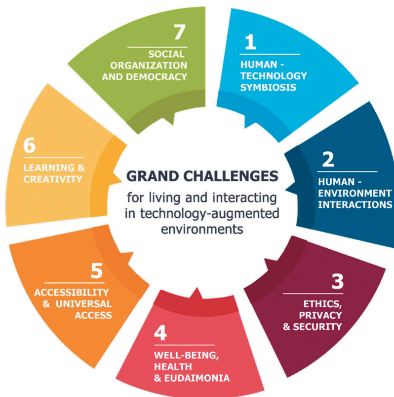
Figure 1. The Seven Grand Challenges.

The effort was motivated by the “intelligence” and the smart features that already exist in current technologies (e.g. smartphone applications monitoring activity and offering tips for a more active and healthy lifestyle, cookies recording web transactions in order to produce personalized experiences) and that can be embedded in future environments we will live in. Yet, the perspective adopted is profoundly human-centered, bringing to the foreground issues that should be further elaborated to achieve a human-centered approach – catering for meaningful human control, human safety and ethics – in support of humans’ health and well-being, learning and creativity, as well as social organization and democracy.