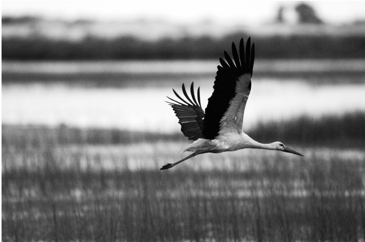
PLATE 1. White Stork ( Ciconia ciconia ) flying over Doñana marshlands in southwestern Spain.

However, individual storks were either specialists or generalists on their foraging substrates (ricefields or dumps) during the study period (autumn–winter 2003). Although our study reflects a specialization on a particular foraging habitat type rather than on a specific diet (i.e., prey items), crayfishes are the prey most frequently consumed by wintering White Storks in ricefields (ranging from 86% to 98% in two different winters; Tablado et al. 2010). In contrast, storks can forage on a large variety of refuse items at dumps of likely lower nutritional quality than that of crayfish, a prey very rich in carotenoids (Negro et al. 2000).