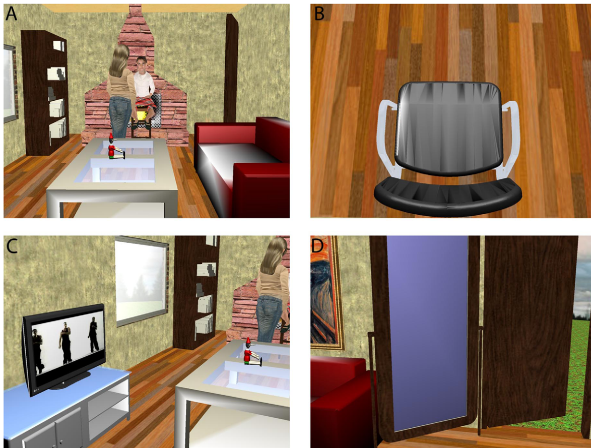
Figure 1. The scene. The scene that the participants entered was a room approximately the same size as the real room in which they were located. (A) There were two female characters at the other end of the room, a standing woman who could be seen stroking the shoulder of a seated girl, and a fireplace behind. (B) Looking down at himself a participant would see an empty chair. (C) To the participant's left was a TV showing a real-time music video. (D) To the right were a mirror frame and a door opening to a field. doi:10.1371/journal.pone.0010564.g001

Immediately after the experience in the virtual reality, a 13-item questionnaire was answered by the participants (Questionnaire S1). Eight of these questions related to the issue of body ownership (Table 3). Perspective gives the clearest set of responses (Figure 3A), where the mean (and median) score for 1PP is always greater than or equal that for 3PP on each of the questions. Movement appears to have no particular effect, and synchronous touch has an effect on some of the variables. From the fitted models estimates of the probabilities of the questionnaire scores for four combinations of the factors were obtained and are shown in Figure 3D. These data show that the most important factors leading to the temporary subjective illusion of ownership of the virtual body are the participant's perspective (i.e. in the girl's body, 1PP) and touch