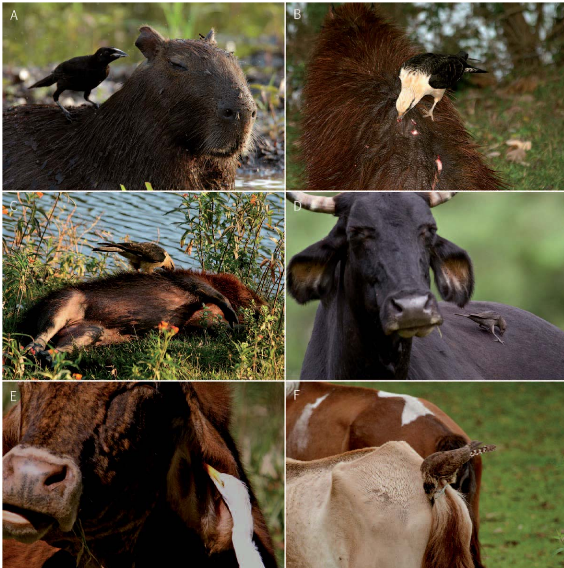
FIG. 1. Selected Brazilian cleaner birds and their hosts. (A) Its head covered with mud, organic debris, and flies, a Capybara is attended by the Giant Cowbird that deftly hunts flies attracted to this host. (B) Gashes on a Capybara's back and rump (due to aggression by dominant individuals) are sought by the Yellow-headed Caracara, which may capitalize on blood and wounded or dead tissue while picking ticks. (C) Posing or facilitation behavior is usual for Capybaras during tick-picking sessions by a cleaner, here the Yellow-headed Caracara. (D) Holding its grasp on a ruminating bovine ( Bos taurus ), a female Shiny Cowbird removes a tick from the host. (E) Close to a resting and ruminating bovine, the Cattle Egret deftly removes a tick from within the ear of this host. (F) Holding its balance on the tail of a grazing Horse, an immature Yellow-headed Caracara removes a tick from its client's rump.

bill morphology (and possibly body size as well), could have played a role in the number of partner species each cleaner visited. However, no bird cleaner in South America or other parts of the world (Sazima and Sazima 2010, Sazima 2011) is as dependent on herbivorous ungulates as the specialized African tick-picking and blood-drinking oxpeckers ( Buphagus spp.), the epitomes of tickbirds (Weeks 1999, 2000; Craig 2009). Their South American rough equivalent would be the Yellow-headed Caracara (Sazima 2011), the cleaner bird for which we recorded the highest number of host species.