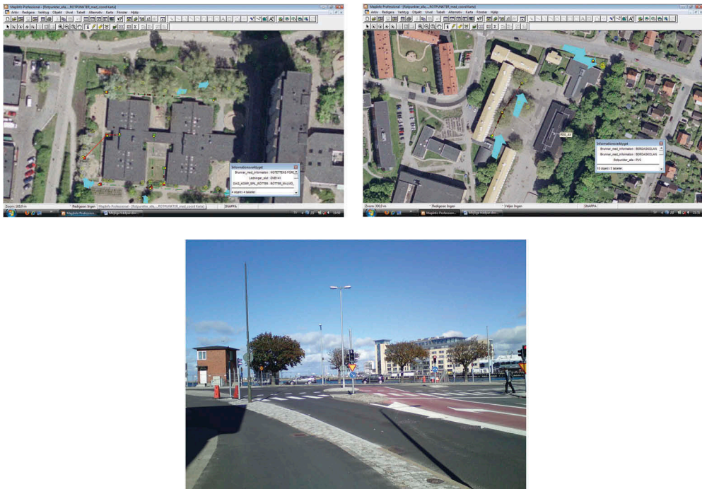
Figure 2. Example screen-shots from the Malmö tree database.

root intrusion and if there were no other trees within 15 m of the root intrusion. As a control, a second tree or bush of the same species and of similar age, growing under similar conditions, was selected to represent the control in the pair (Table 1). The control individual was always located at a distance from the point of the root intrusion and with the sampled tree located between it and the intrusion point, to ensure that the roots of the control had not reached the pipe.