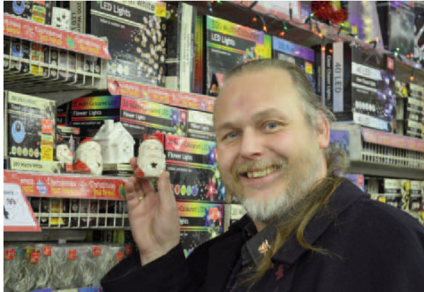
Fig. 2. The author, acquiring 'Klausel' in a pound-shop in Bangor, UK.

ing to the definitions of the term in § 1 (1 and 2) DMSG (fig. 3). I then proceeded to “research” it “in situ with the purpose of discovering and examining” this archaeological monument “under the surface of the earth or water” by a visual survey, followed upon its discovery by its “excavation by hand” and “with tools” 3 (fig. 4); but without the allegedly required permit by the BDA according to § 11 (1) DMSG.