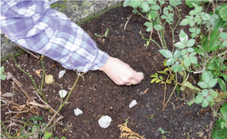
Fig. 3. The author's wife, creating the 'artificial soil formation' – a mini-tumulus surrounded by a circle of smaller and crowned by a slightly larger specimen of 'standing pebbles' – in the author's parents' garden in Vienna (image: H. Karl).