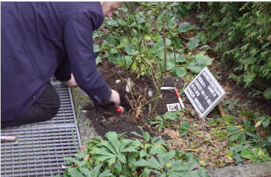
Fig. 4. The author, 'illegally' excavating the 'monument' c. 20 minutes after its creation.