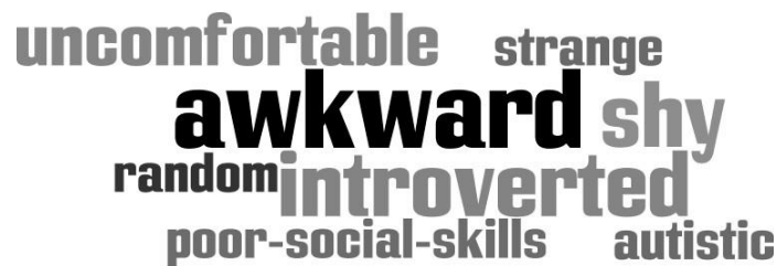
Fig. 3. Personality descriptors used by participants in the Echoborg condition to describe their interlocutor. Word cloud shows descriptors that had a frequency greater than or equal to 3. Larger text size indicates greater relative frequency.

Considering the written evaluations and post-interaction interviews, participants who spoke with an echoborg used a total of 86 unique descriptors to characterize their interlocutor, compared to 80 unique descriptors used by those who had spoken to a text interface. All descriptors which had a unique frequency of at least 3 (i.e., the descriptor was used by at least 3 participants in the same experimental condition) are shown in word clouds below (Fig. 3 and Fig. 4). The most frequent descriptors used in the Echoborg condition were “awkward” (6 different participants used this descriptor), “shy” (5), “introverted” (5), “uncomfortable” (4), “autistic” (3), “strange” (3), “poor social skills” (3), and “random” (3). The most frequent descriptors used by those in the Text Interface condition were “computer” (6), “strange” (5), “robotic” (5), “mechanical” (4), “introverted” (4), “difficult” (3), “friendly” (3), “random” (3), “nonsensical” (3), “odd” (3), and “asocial” (3).