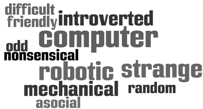
Fig. 4. Personality descriptors used by participants in the Text Interface condition