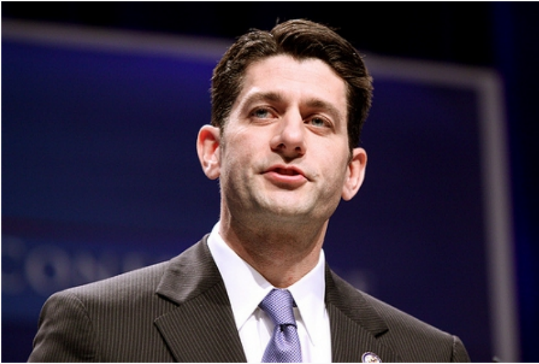
Congressman Paul Ryan

This week was a turbulent one in the House – though previously expected to win the Speakership election scheduled for Thursday, Wednesday saw the House Freedom Caucus turn against the Majority Leader, Kevin McCarthy, in favor of Representative Daniel Webster (R-FL) reports The Federalist . Thursday saw the surprise announcement by McCarthy that he would not be pursuing the Speakership, throwing the House GOP into disarray ( The Daily Signal ). In light of McCarthy's withdrawal, The Fix wonders who will be Speaker. They say that the GOP may have to convince the current head of the Ways and Means Committee, Paul Ryan (R-WI) to run for the job. FiveThirtyEight says that McCarthy's Speaker bid was doomed because of his split with House conservatives over legislative tactics. The Federalist reckons we should all relax and remember that this is exactly how Congress should work .