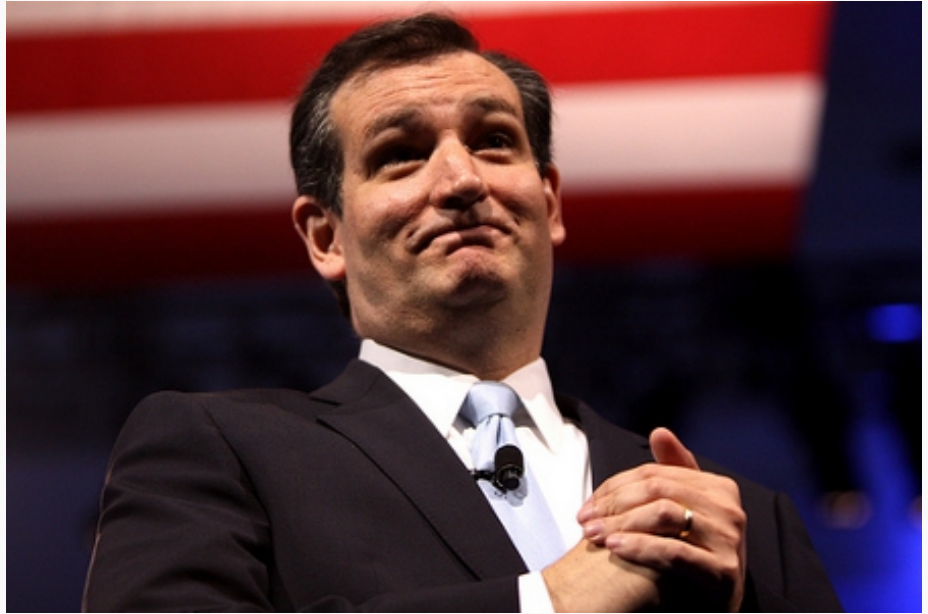
Texas Senator Ted Cruz

that he was running for President, the first major GOP candidate to do so. National Review's The Campaign Spot comments that 50 percent of U.S. adults don't actually have an opinion about Cruz, according to recent polls, despite his being at the centre of the government shutdown debate in late 2013. FiveThirtyEight reacts quickly to Cruz's announcement, and not at all positively. They write that he is too extreme and too disliked to actually win the presidency next year. While he will get a great deal of media attention, they say, he does not have the support from senior party members, and that he is far too conservative compared to the GOP's recent nominees. The Federalist , on the other hand, is far more optimistic, giving three reasons why Cruz could actually win – that he matches to the activist base, he