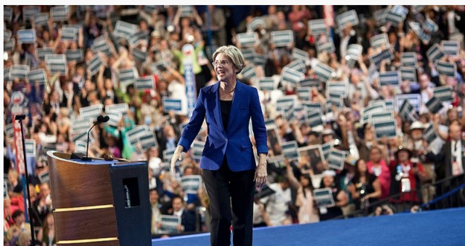
Elizabeth Warren

that the GOP needs to win Governors mansions in order to control "voting mechanisms" and ensure accurate vote counts in those states, writes Crooks & Liars . Speaking over Governors, with 28 up for reelection in this year's midterms, the Monkey Cage looks at who we might want to watch with 2016 in mind. Leading the pack are New York's Andrew Cuomo, New Mexico's Susana Martinez and Scott Walker of Wisconsin. One member of the Republican Party who is almost certain to run for President in 2016 is Texas Senator, Ted Cruz. This week