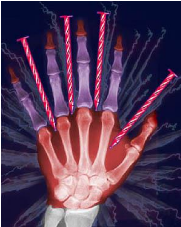
Figure 1: 'hand pain' by jilly999

Immediacy is central to Flickr. The default, photostream setting is chronologically based and loads newest images first. Van Dijck characterises it as ‘a constantly changing database that lacks even the most elementary principles of an archive’s ordering and preservation system’ (2011: 409). An ongoing series such as a 365 project allows a more sustained, less fragmented narrative structure to appear. Images may still be viewed out of context, but often reference is made to the fact that the images are part of a series; they refer to other images. What these series show is the passage of time: chronic pain and chronic illness don’t simply cause severe suffering in an instant, but are part of an extended daily struggle. For instance, in a series from a 365 project by user Snowflakesarewhite, ‘spoon theory’ 1 is illustrated literally by showing how many ‘spoons’ (units of energy) are used during daily activities such as showering and having breakfast. The caption on the image below refers to the energy it takes to stand up in the shower, to lift her hands above her head to wash her hair, and deal with the effects of the heat and humidity. The photographer’s feet and painted toenails