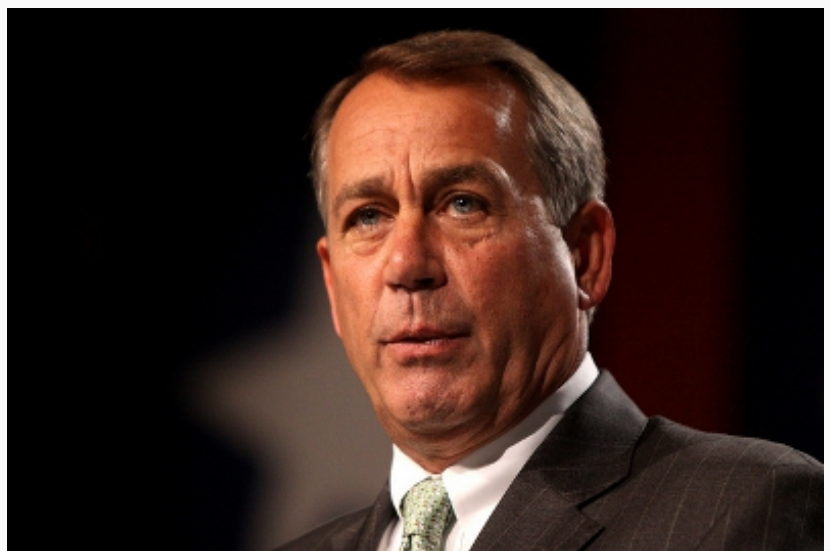
Speaker of the House John Boehner

This week Daily Kos reports that House Republicans, led by Speaker, John Boehner of Ohio, have allocated $350,000 towards their lawsuit against President Obama. They say that given the law firm they have hired to pursue the suit charge $500 an hour, $350,000 may not go very far. They say that the money is really a 'slush fund' to keep the lawsuit issue alive through the mid-term election season. On Wednesday, The Atlantic looks at whether or not the House GOP will shut down the government once again, when the funding bill passed in January expires at the end of September. They say that House GOP leadership is increasingly worried that conservative members will not go along with a simply continuing resolution to fund the government.