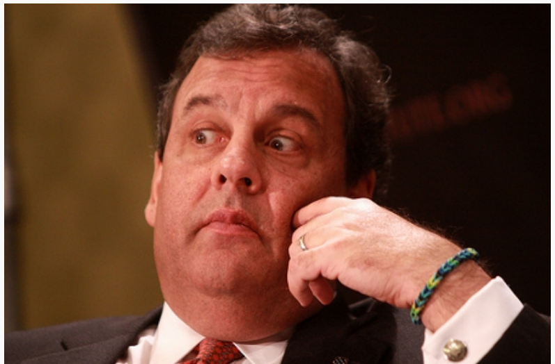
New Jersey Governor Chris Christie