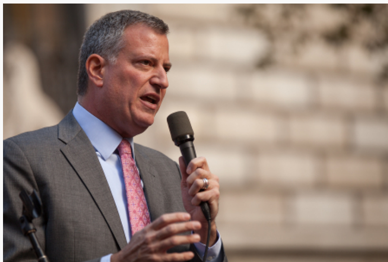
Bill de Blasio

Moving east to Massachusetts, Blue Mass Group writes on Tuesday that despite the problems with the state's Obamacare exchange, the percentage of the state's residents who do not have health insurance is now less than 1 percent.